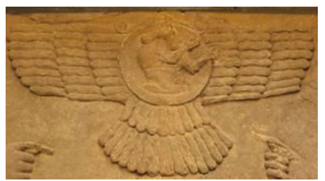
Img. 3 Ra, Egyptian Sun God. According to Mesopotamic mythology, Shamash Northwestern Palace, Nimrud; 865-860 B.C.