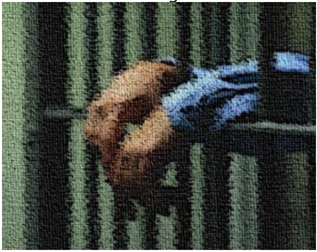
A cold iron gate closes. A tale thus unravels. My tale, worthy of a book.

Do you really think the year we live in, 2017, is the future? The world was to be full of spaceships, and the whole universe mostly inhabited. All of us should be rich! Don't you think that, instead, our world has birthed a society whose characteristics are comparable to slavery? An illness whose violent return is robbing us of passion, destroying us with fatigue and imposing upon us a short and unfulfilling life? Clang.