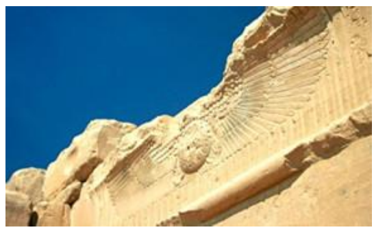
Img. 4 Ra, Egyptian Sun God. According to the legends, he created the universe from a pyramidal debris tower, and then created everyone else.